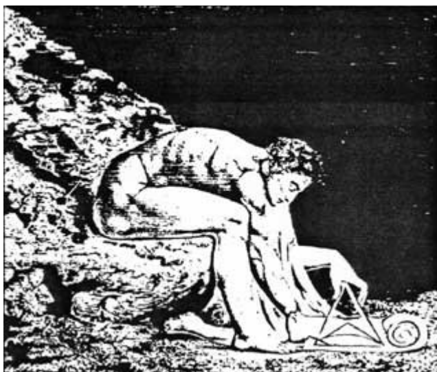
Blake's portrait of Sir Isaac Newton. The eighteenth-century physicist revolutionized science with his belief that out of observations of facts theories arise—not vice versa.

There is a widespread tendency, dating back at least to Francis Bacon, to answer “yes.” The argument is that a plausible explanation, even if wrong, will suggest lines of further investigation that may be productive. On the other hand, it is easy to see that adhering to Aristotle’s inventive theories was a serious impediment to scientific progress. It can logically be deduced that insistence on adhering to the modern inventive theories is having a similar effect today.